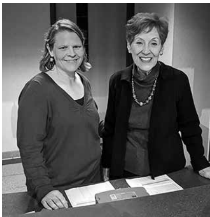
Friendly faces at WCC!